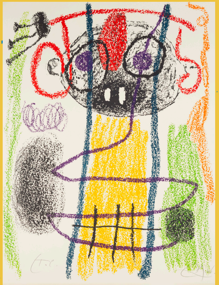
Album 21 (Poème De Carlos Franqui) No. 2