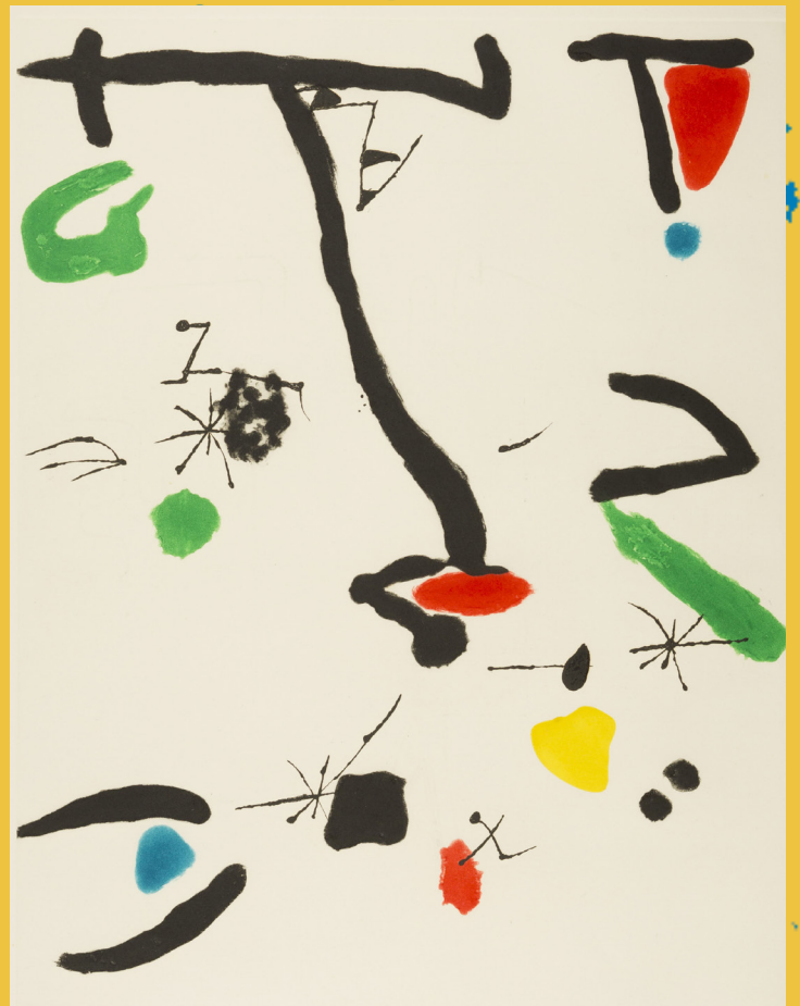
Son Abrines II