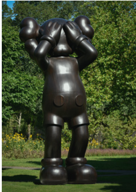
— AT THIS TIME (2013). Wood, 574 x 260 x 215 cm.

The historic landscape has become home to six huge sculptures by KAWS of key characters that he has brought into being. Throughout its history, sculpture in public space has tended to celebrate the winners in life: kings, presidents and heroes on horseback, who are raised high above the rest of society on tall plinths. In contrast, KAWS' open-air sculptures are in real-life, momentary, poses.