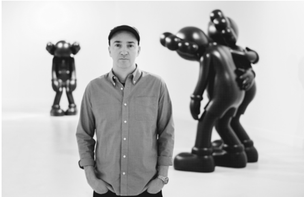
KAWS.

Welcome to the first UK exhibition of work by the US artist KAWS. Born in 1974 in New Jersey, KAWS has established an international career and creates characterful sculptures and complex, colourful paintings that knowingly blur the boundaries between fine art and contemporary culture.