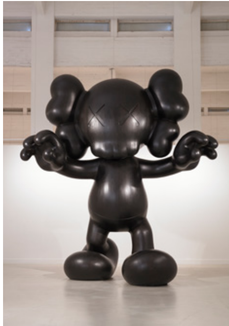
— FINAL DAYS , 2014. Wood, 600 x 530 x 380cm. Courtesy the artist and More Gallery

FINAL DAYS (2013) has a sinister presence, despite its toddler proportions, in part due to its height at six metres but also our inability to make eye contact. Its posture is like an infant learning to walk, but could be read more negatively as threatening our final days.