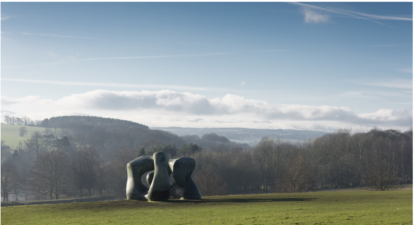
Henry Moore, Large Two Forms, 1969.

If you would like to receive regular updates about our Formal Learning Programme, please sign up to our mailing list via our website and select 'schools, colleges & universities info': yvsp.org.uk