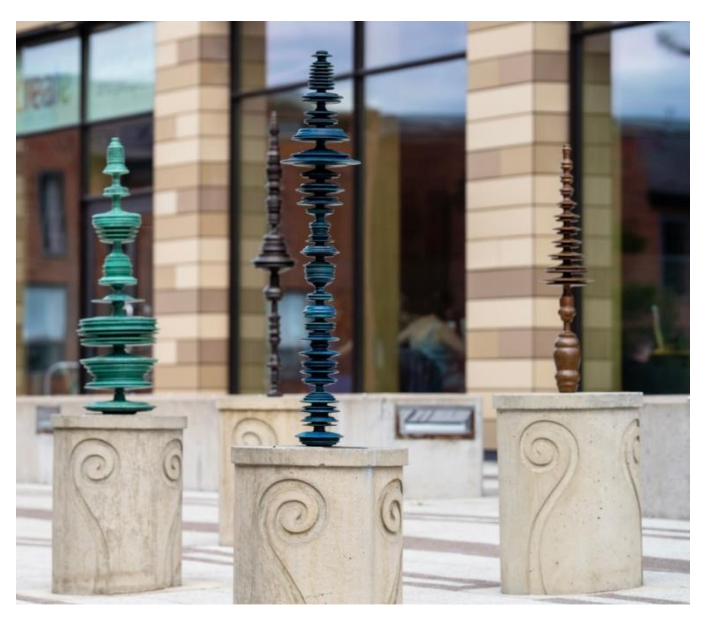
Andy Holden, The Auguries (Last Calls) , 2023

Key Facts: Halima Cassell loves maths and works with geometric, repeating patterns. The details are based on the idea of lots of rotating fans. The terracotta matches the red brick of local mills.