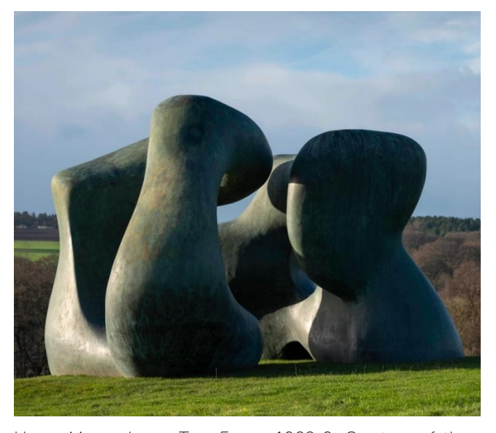
Henry Moore, Large Two Forms, 1966–9. Courtesy of the Henry Moore Foundation.

Key Facts: Over 3m tall. It has leg braces, linking to the artist who is partially paralysed. It explores his parent's love story - his mum worked at Walton Hall and would persuade the night watchman to row her back to the hall after their dates.