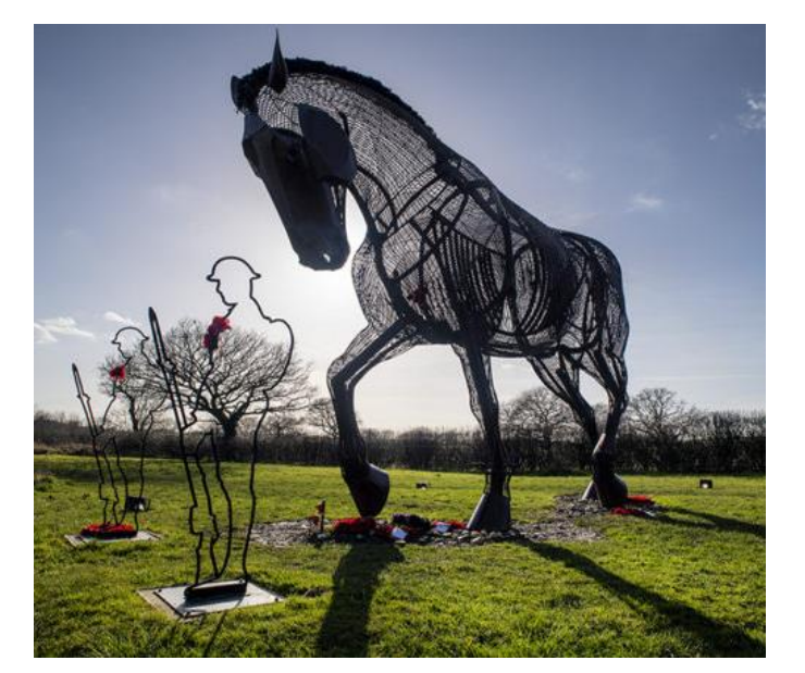
Cod Steaks, War Horse: A Place of Peace To Be Together

Key Facts: A memorial sculpture commemorating the 353 soldiers from Featherstone killed in WW1. Designed as a place of peace, remembrance and reflection.